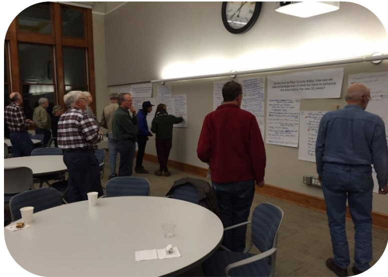
Citizen Participation at community forum in Northfield.

The 2040 Comprehensive Plan update began with public outreach that included three community forums. Community members gathered in three different locations and were informed about the comprehensive planning process and participated in a series of small group discussions. A total of 99 attendees responded to four questions asked at each meeting.